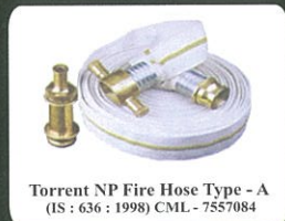
Torrent NP Fire Hose Type - A (IS : 636 : 1998) CML - 7557084

CANVAS FIRE FIGHTING HOSES LANDING VALVES & GUN METAL ACCESSORIES